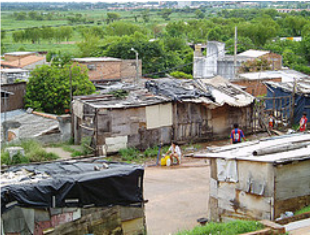
Fiona L Cooper: CC license applies